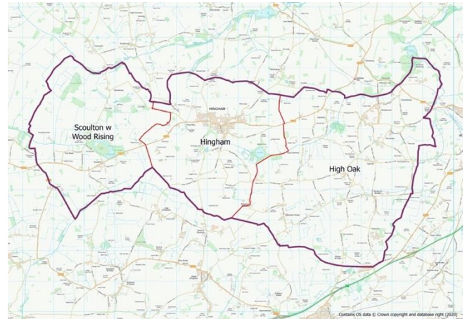
Parishes of the Benefice of High Oak and

In the centre of the benefice is Hingham, a small Georgian town with a population of about 2,500. Scoulton with Woodrising is a deeply rural area where the two parish churches serve a total population of fewer than 300.